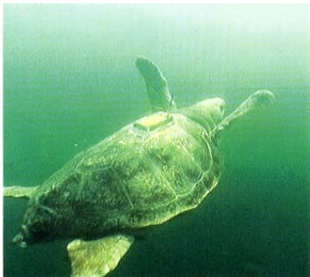
Adelita swims away with transmitter.

a Shinto priestess leads the way a goddess path from Mexico to the arribada on a distant Kyushu shore